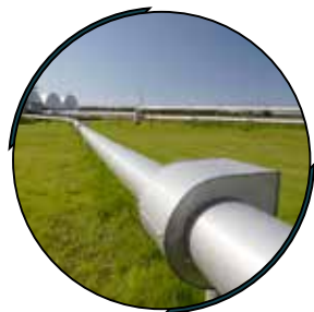
OIL & GAS PIPELINES

The PCS Midstream Transaction Group serves as technical pipeline experts to assist operators through the acquisition or divestment process: identifying risk, offering project management, and preparing both parties for deal close.