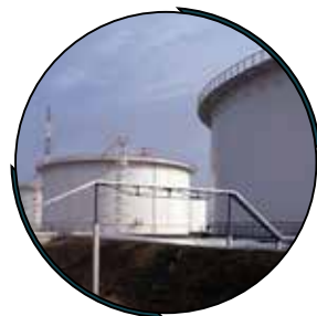
TERMINALS & STORAGE

Founded in offshore engineering & construction services, PCS acts as an expert advisor to operations & new development in the Gulf of Mexico.